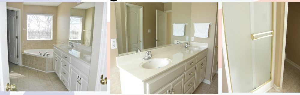
UPPER LEVEL: Photos of other three bedrooms and the hall bath that has double vanity sink.