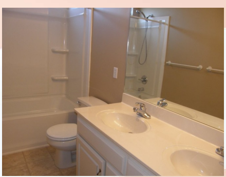
BASEMENT LEVEL: Photos of family room, 5th bedroom, & full bath.